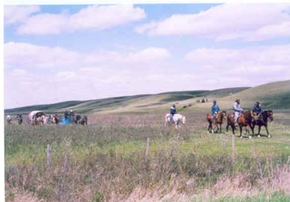
Above: Trail ride in Arm River Valley, May 2003

Q's with prices for meals, and sales of maps, photos, souvenirs and more.