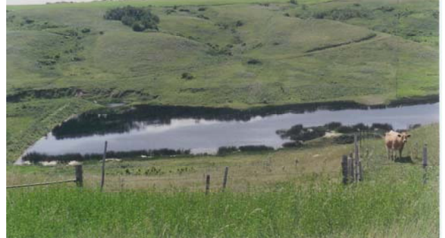
Iskwao Creek at Schollar's Pasture, Craik. Picture the 'Living Sky' above this Valley!

Iskwao is a Cree word meaning 'woman', a mature woman, a sister, mother, aunt, etc. In the old days it was a very respectful word. The early English settlers had difficulty saying the word the way the Cree said it, so they invented the word 'squaw' and began calling native women this word, sometimes in a derogative way.