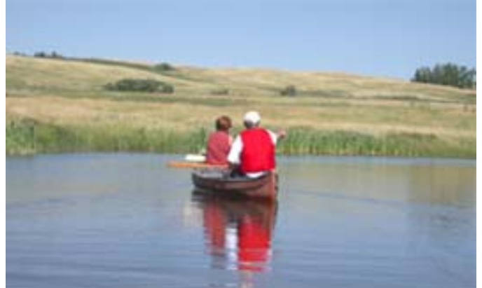
Canoeing on Arm Lake

visit this area through the auspices of TRTA. A TRTA trail will be established going from Craik Golf Course, north along the west side of the Craik Reservoir.