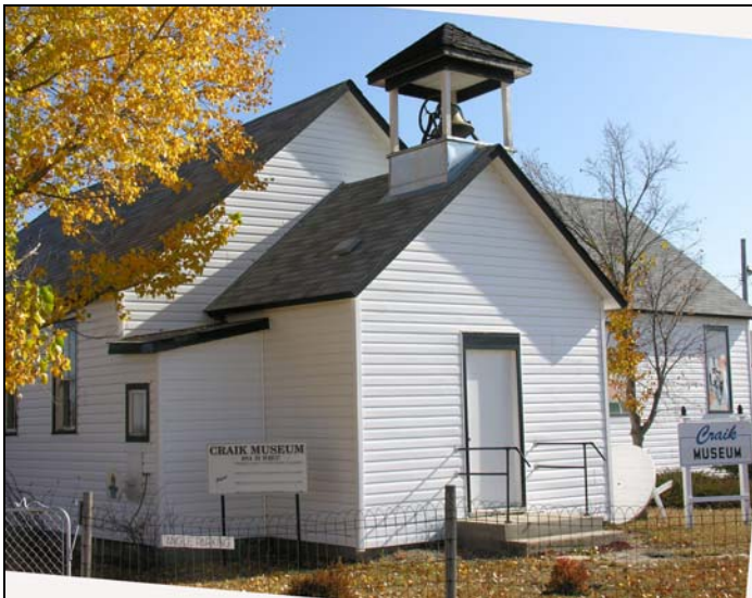
Above: The Craik Museum. Part of it was once the Sprattsville School 18 miles west of Craik.

Scotland and Ontario. On the other hand, land agents for American firms attracted settlers to areas south of the Qu'Appelle (Eyebrow).