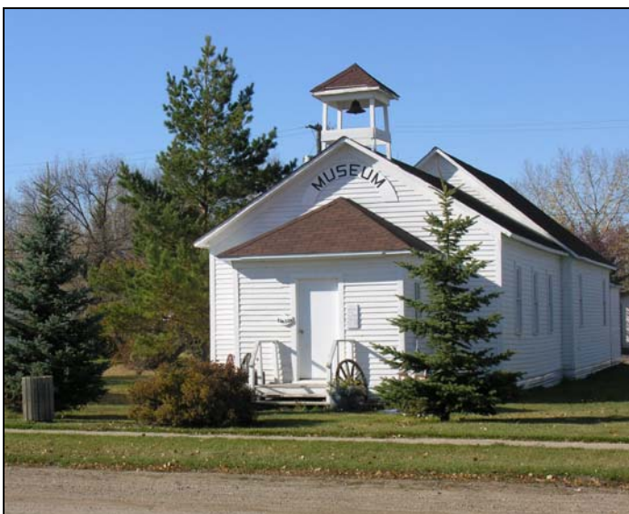
Above: The Elbow Museum was once a country school too.

The cultural aspects of the early settlement of the prairies, backed up with artifact displays, are well documented by the Western Development Museums in Saskatchewan. However, to get the region perspective (flavor) one needs to look carefully at the smaller museums. They reflect the ethnic make-up of settlement, and the artifacts reflect on their origins in the old-country (their terminology). Most settlers came to the districts north of the Qu'Appelle Valley as a result of advertisements in England,