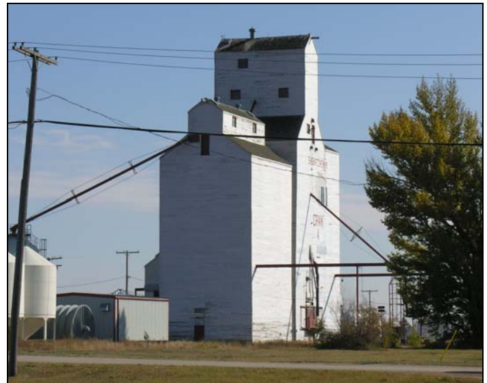
Above: Two saved elevators, top is in Elbow, below in Craik.